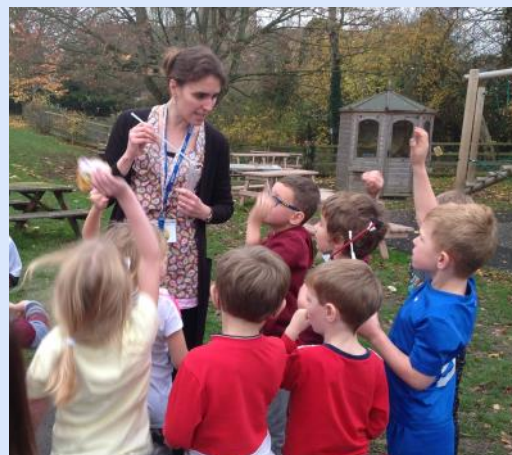
Science experiments with Oak Class