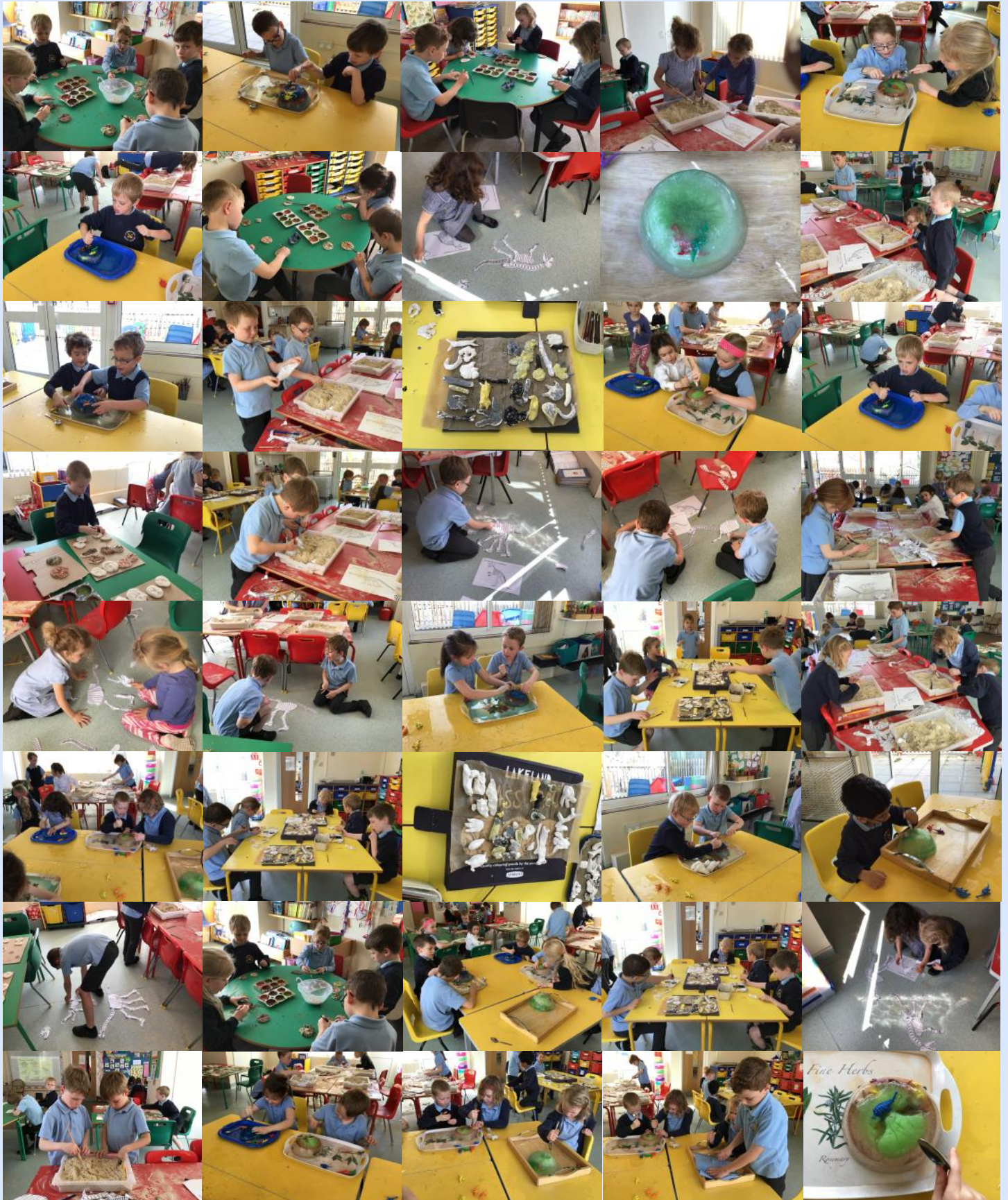
Oak Class have had loads of fun this week doing lots of dinosaur and fossil themed activities.