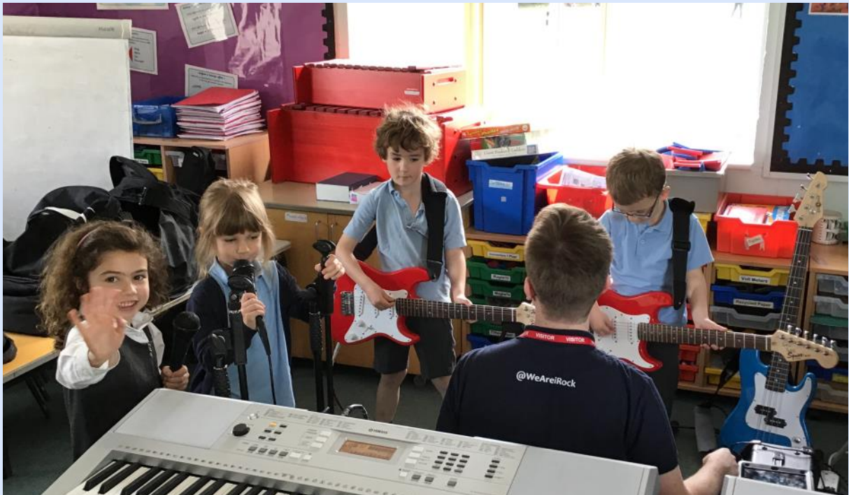
Our final iRock band!