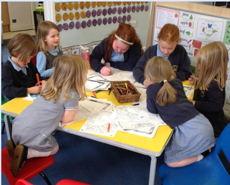
Year 5 enjoyed spending time with the younger children in Apple Tree class this afternoon.