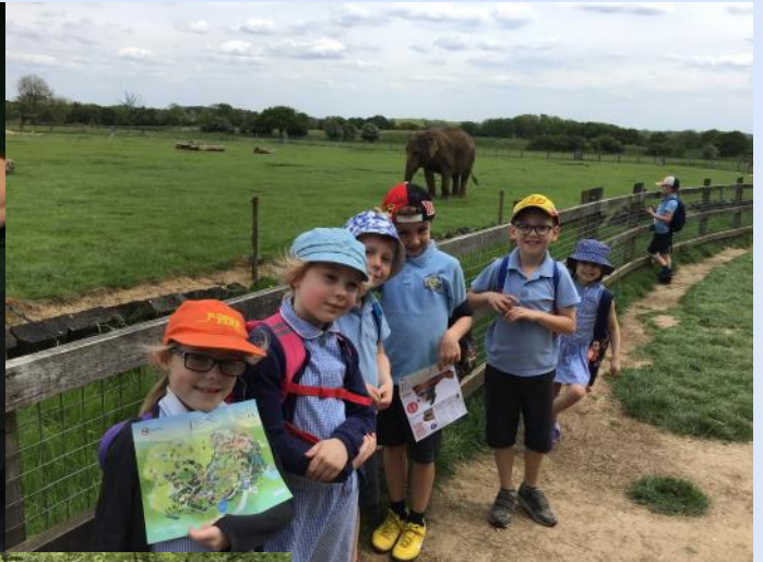
Oak class at Whipsnade Zoo.