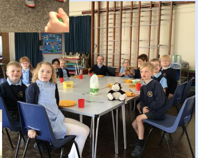
Year 2 enjoying their post-SATs breakfast.