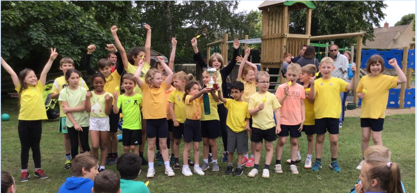
Congratulations to the Sparrowhawks who won our KS1&2 sports day