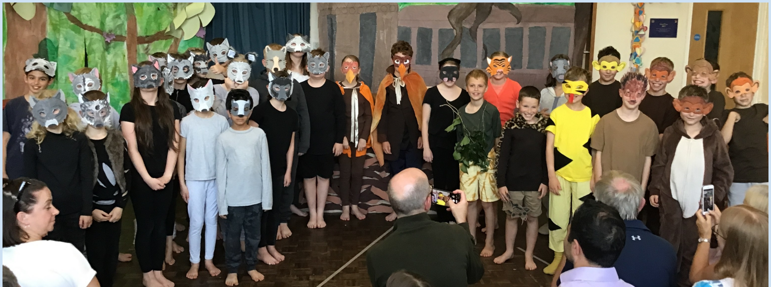
Willow Class performing 'The Jungle Book'.