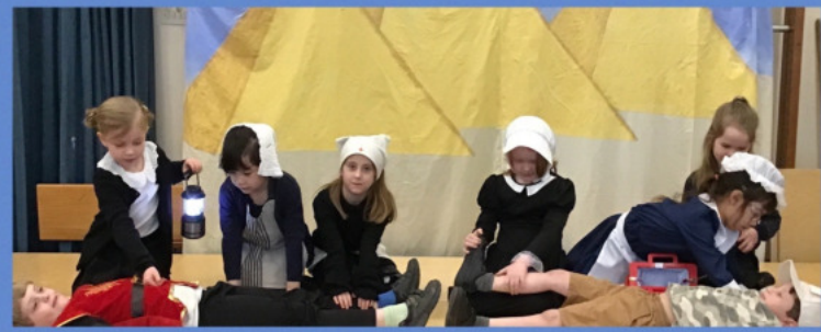
Florence Nightingale Woz Day!