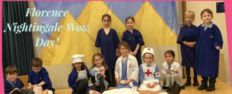
Florence Nightingale Woz Day!