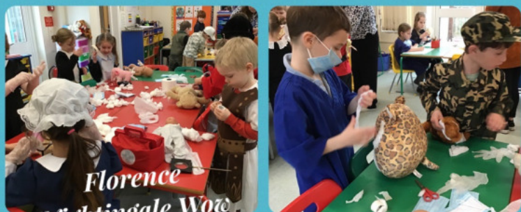
Florence Nightingale Woz Day!