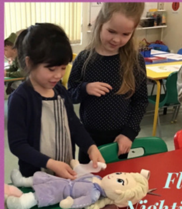
Florence Nightingale Woz Day!