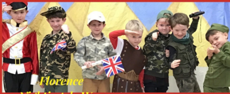
Florence Nightingale Woz Day!