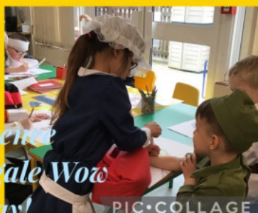
Florence Nightingale Week Day!