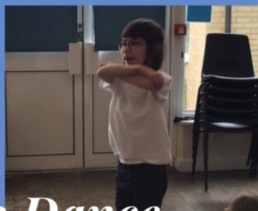
Step 2 Dance